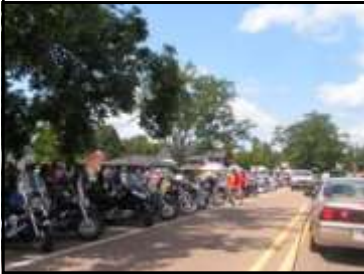
Line of bikes on main street at the Little Sturgis Motorcycle rally on 8/21/10. This is just a few of them.