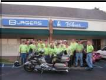
Supper Ride to Burgers & Blues on 8/24/10.