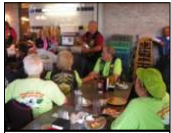
Trip to Rome, GA, during the dinner meeting. We were all overstuffed!