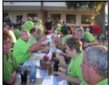
Members waiting to place their orders at Burgers & Blues on 8/24/10.