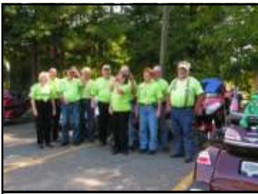
Trip to Rome, GA, 8/7/10, to try to capture the Traveler's Plaque but lost to Jacksonville, FL. We did have fun!